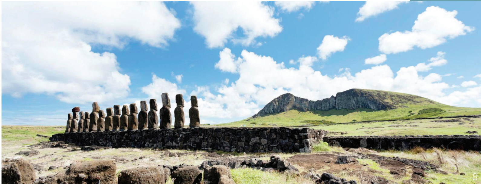
4 Machu Picchu 5 TCS World Travel Private Jet 6 Interior 7 Taj Mahal 8 Easter Island