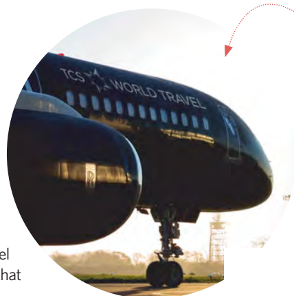
Board TCS's custom Boeing 757 for a journey around the world

Volcanoes National Park in Rwanda is where Dian Fossey famously studied mountain gorillas in their natural habitat, and you're set to do the same. Stay at the lauded Bisate Lodge — the setting alone is awe-inspiring. It is built into a natural amphitheater